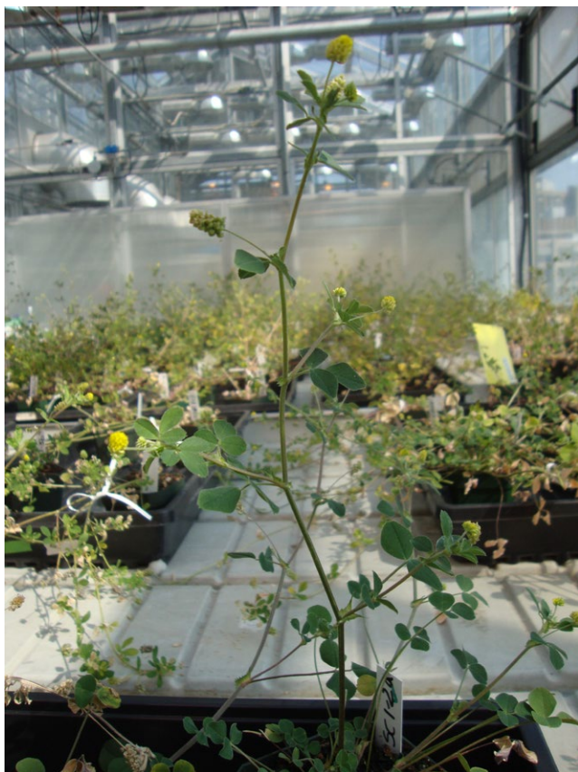
FIGURE 1 A Medicago lupulina individual flowering in the greenhouse

We planted F_1 greenhouse-derived seeds of 43 maternal families (27 from the north and 16 from the south) in a split-plot randomized complete block design in the greenhouse at the University of Toronto. Each block was divided into two bacterial treatments, each containing 15 northern and 11 southern plants, the locations of which were randomized within blocks. Populations were split across blocks. Due to seed limitations, not all families were represented in every block, but within a block both bacterial treatments comprised the same 26 families. We replicated this design across six blocks, for a total of 312 plants (6–13 replicates per family for 37 families; 1–4 replicates per family